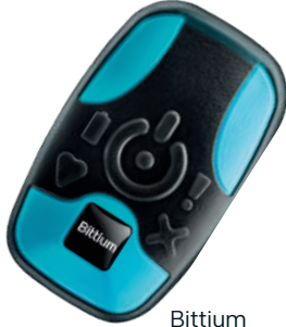
Bittium Faros™ 180 1 , 7