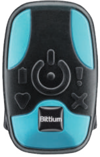
Bittium Faros™ 180L 1 , 14